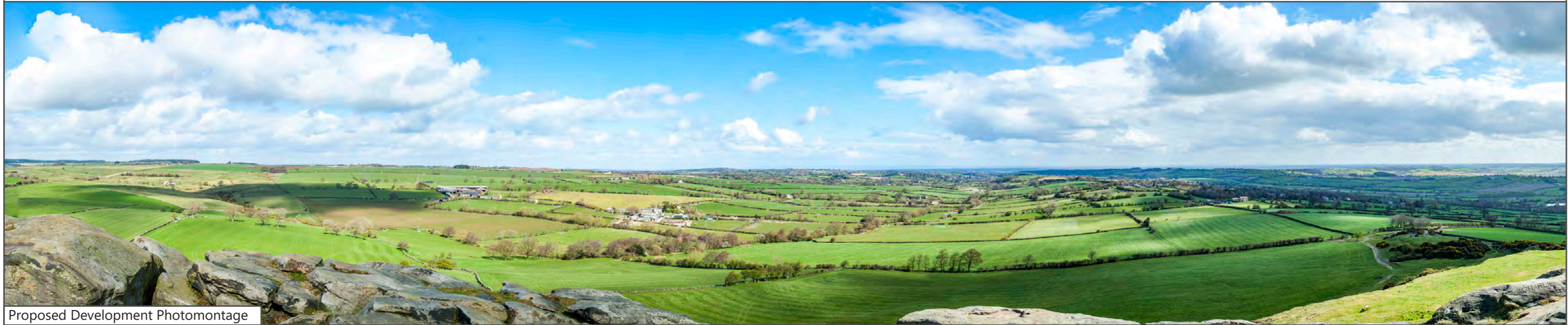
Proposed Development Photomontage