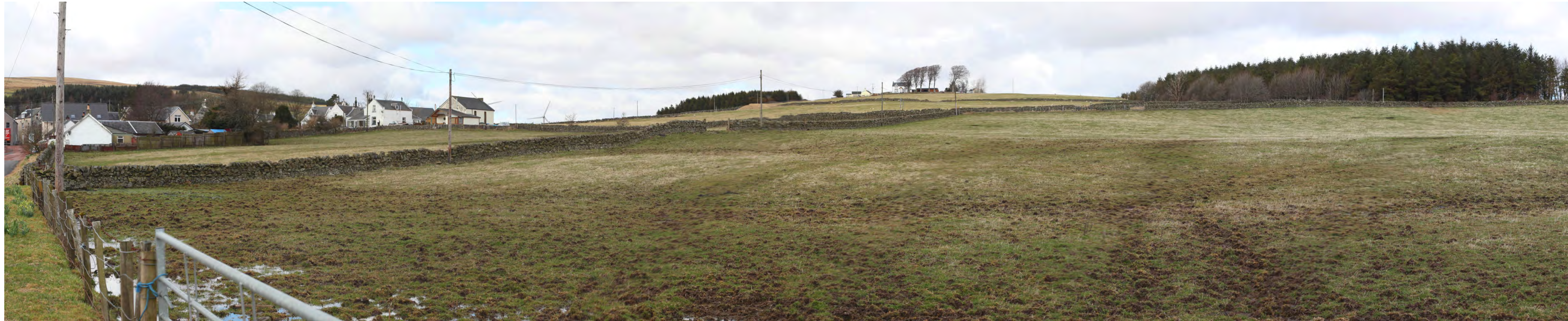
SEI2 SCHEME PHOTOMONTAGE VIEW