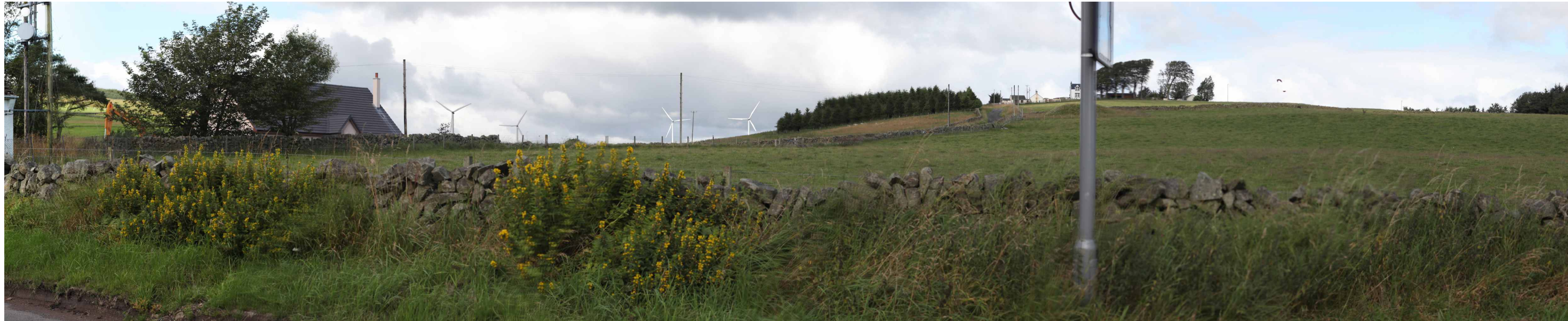
SEI2 SCHEME PHOTOMONTAGE VIEW