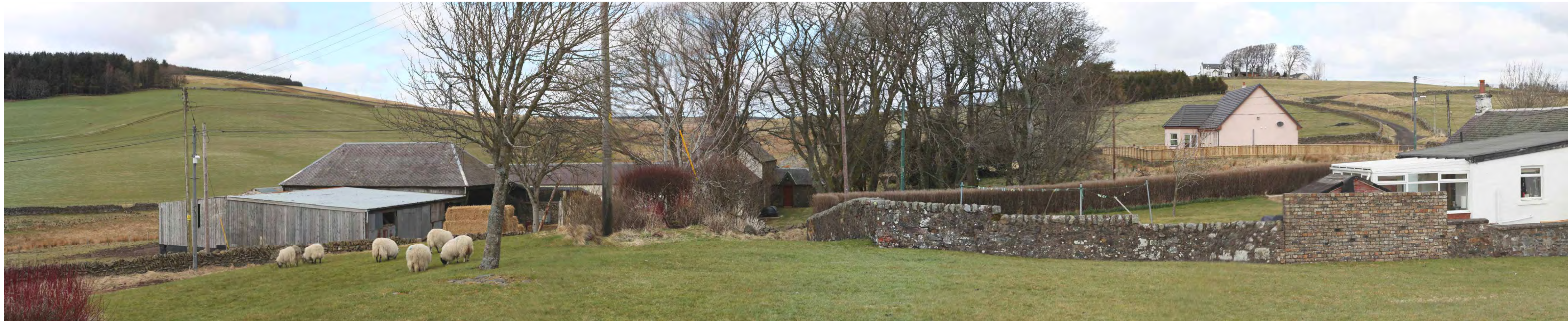
SEI2 SCHEME PHOTOMONTAGE VIEW