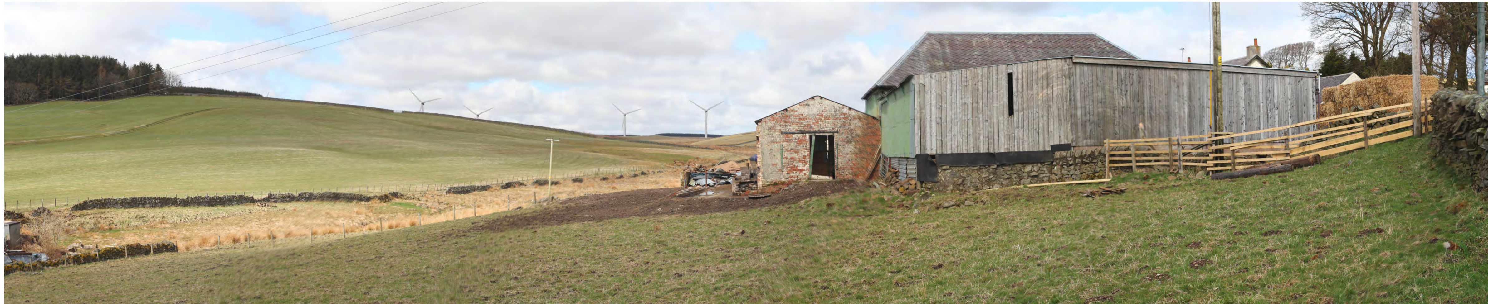
SEI2 SCHEME PHOTOMONTAGE VIEW