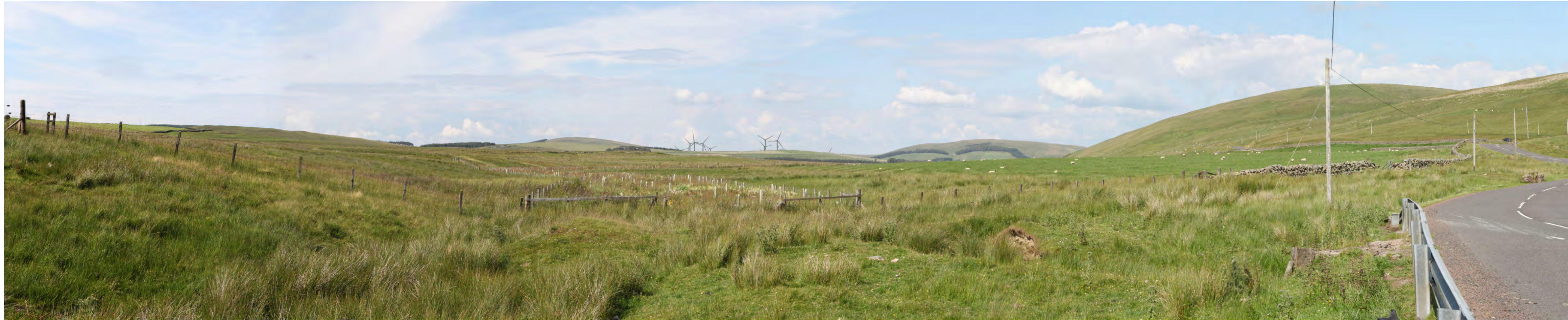
SEI2 SCHEME PHOTOMONTAGE VIEW