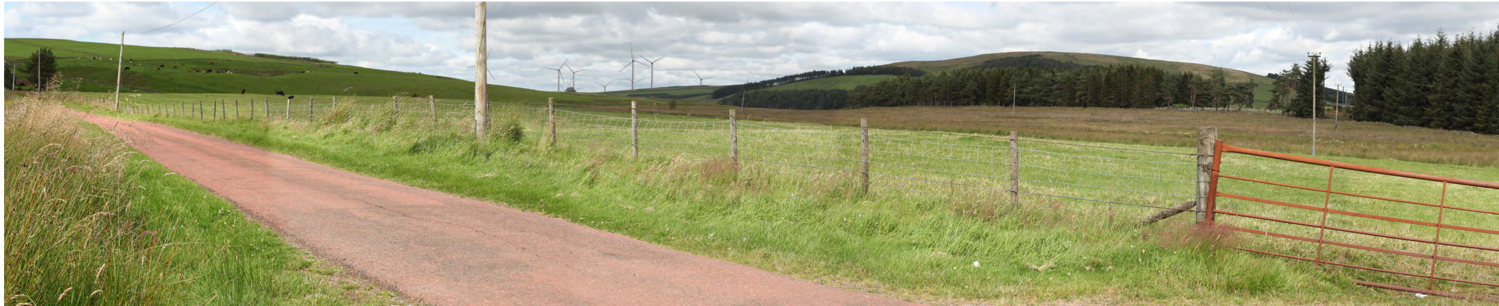
SEI2 SCHEME PHOTOMONTAGE VIEW